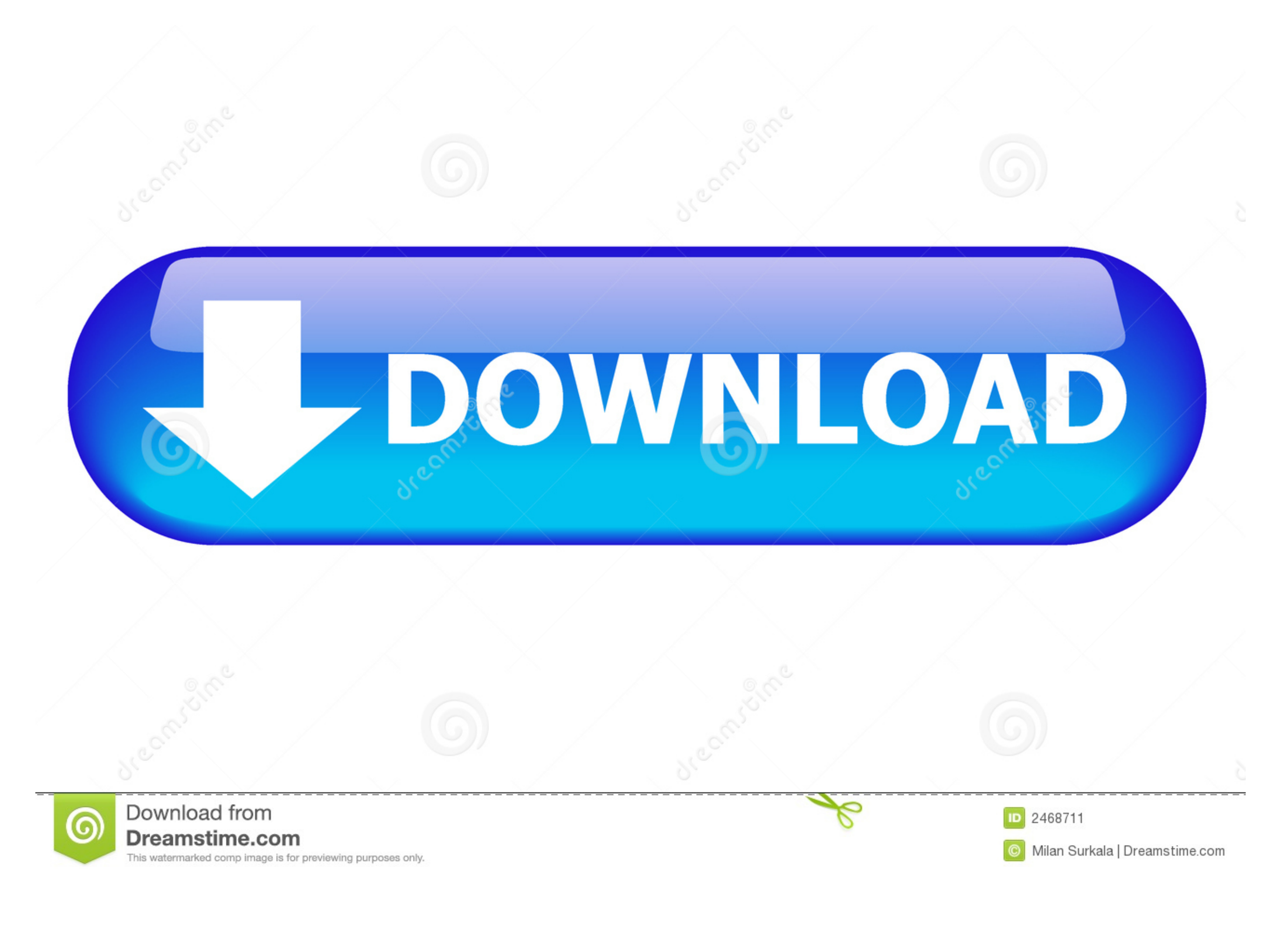
Samsung Remote Client Username Password Hack | Added By Users